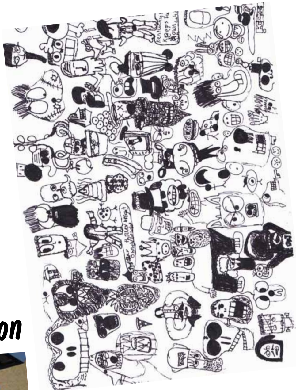
guest illustrator: Miles Dodd